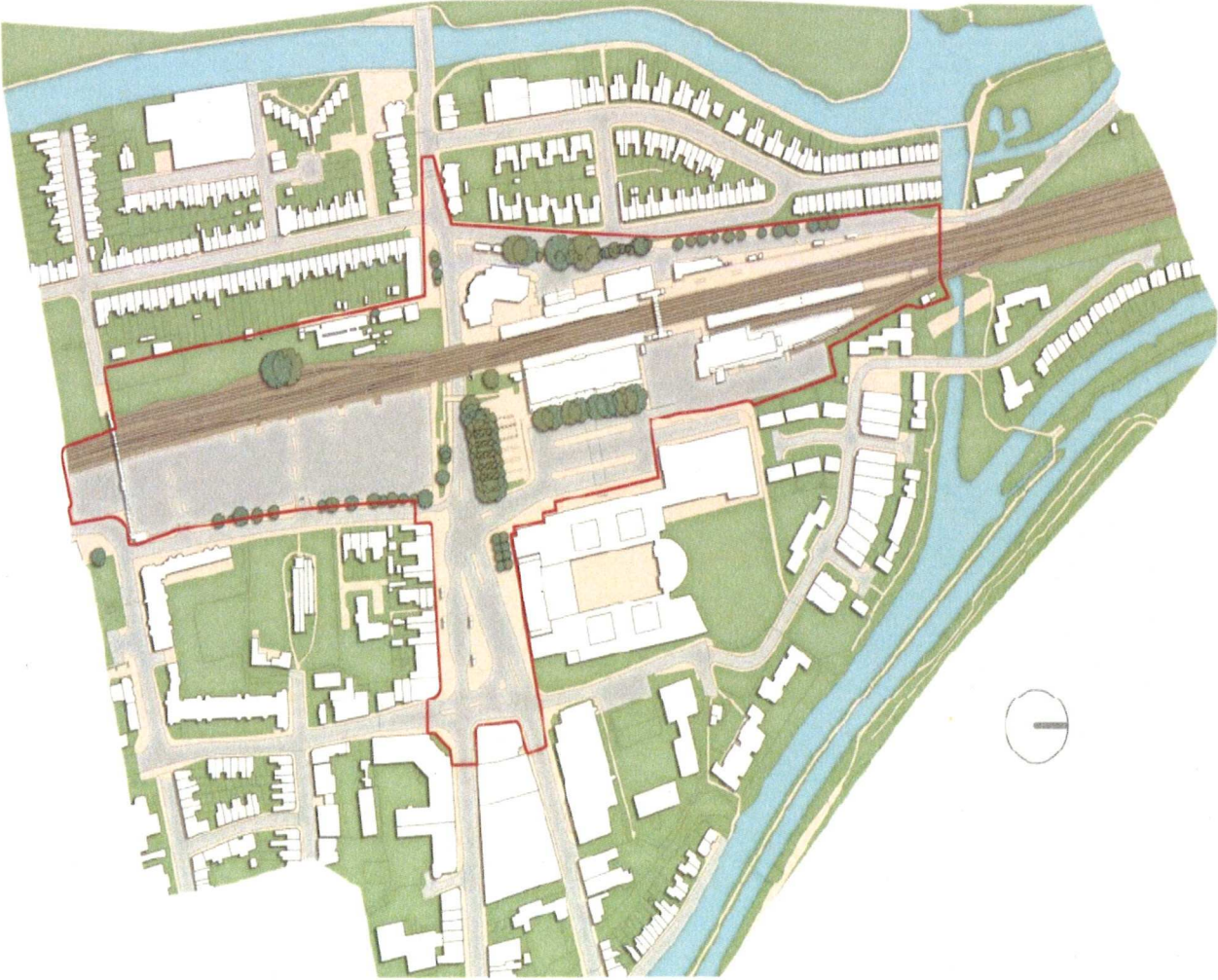
Source: Oxford Station AEDAS Stakeholder Presentation Event 03.11.13